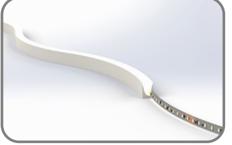
Only bend the liniLED® Side Diffuse LED strips in sideward directions. See image above for an example.