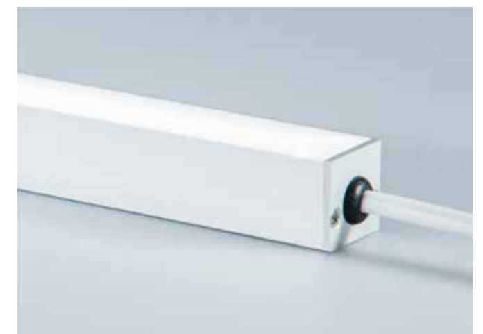
Example liniLED® Aeris IP67