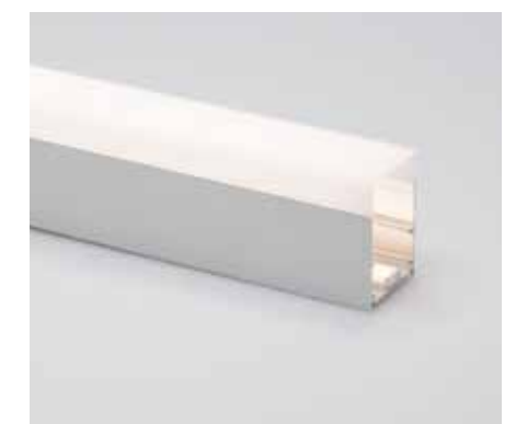
Cover clear low