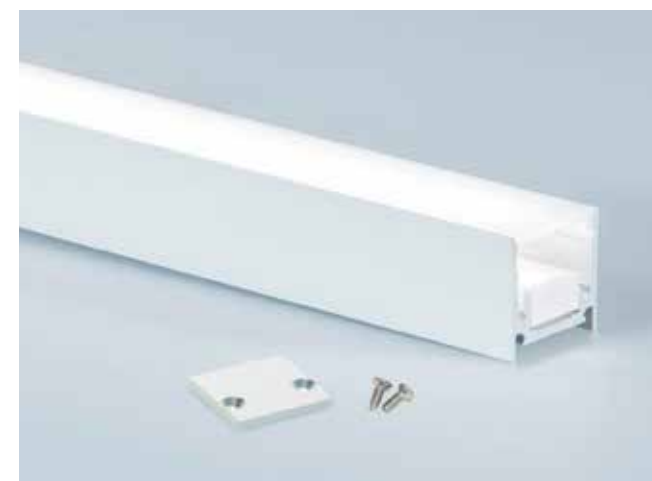
Example liniLED® Aeris IP40

Walk-over profiles available on request.