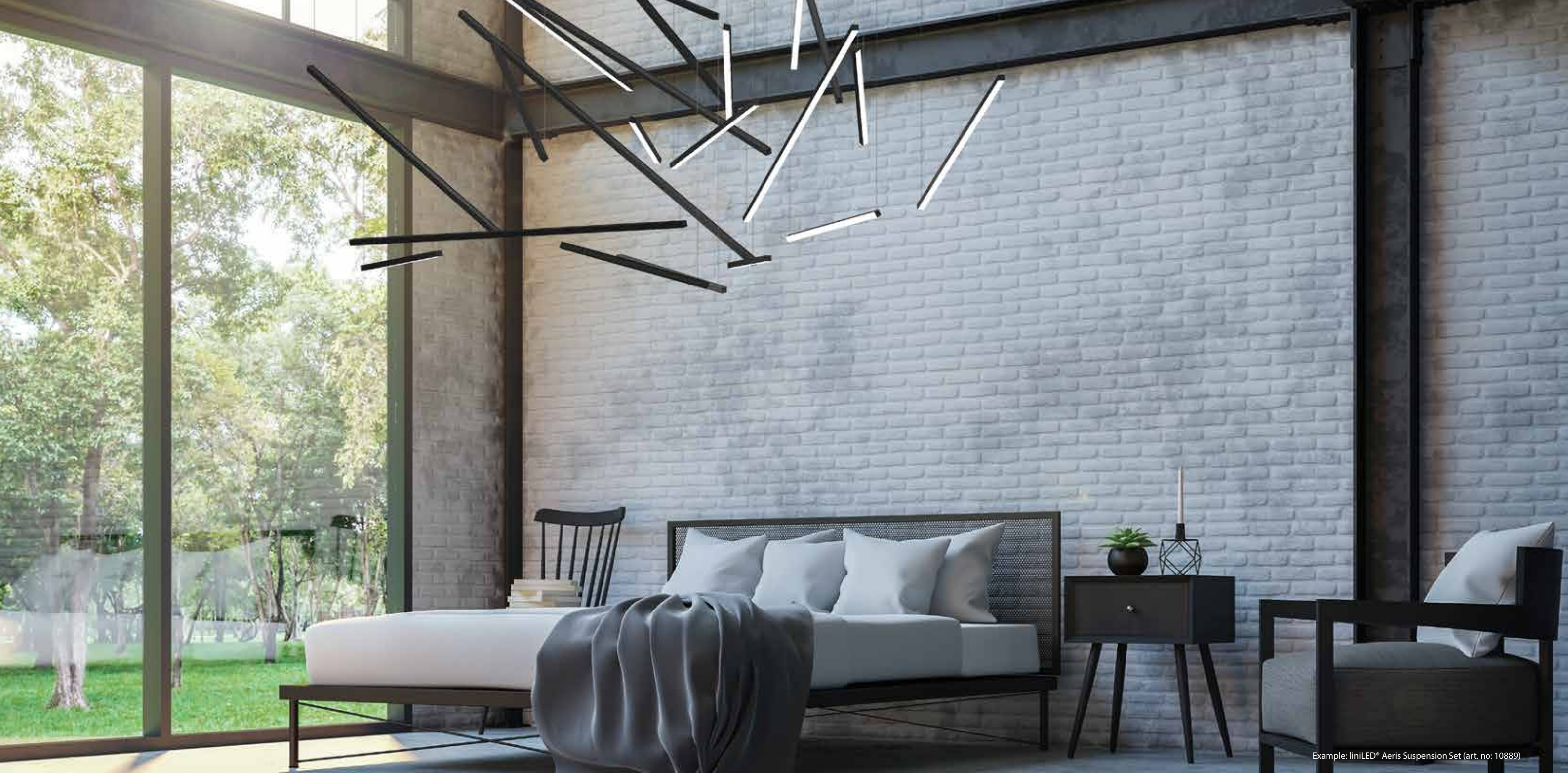
Example: liniLED® Aeris Suspension Set (art. no: 10889)